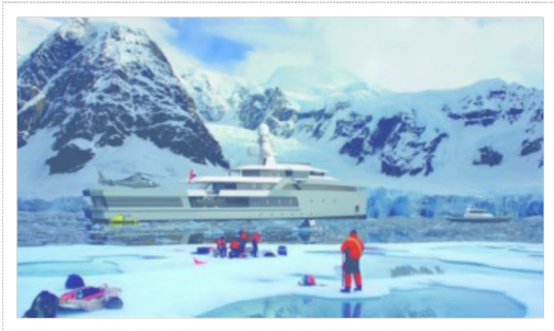
Amels 188 and Damen SeaXplorer: 2 Models, 2 Styles In "Motoryachts"