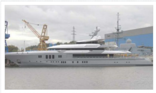
EXCLUSIVE: Mogambo Emerges From Nobiskrug In "Motoryachts"

DESIGNERS , LEADERSHIP SERIES , PEOPLE REYMOND LANGTON DESIGN . PERMALINK .