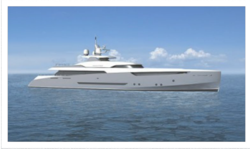
Pendennis Presents Phantom In "Motoryachts"